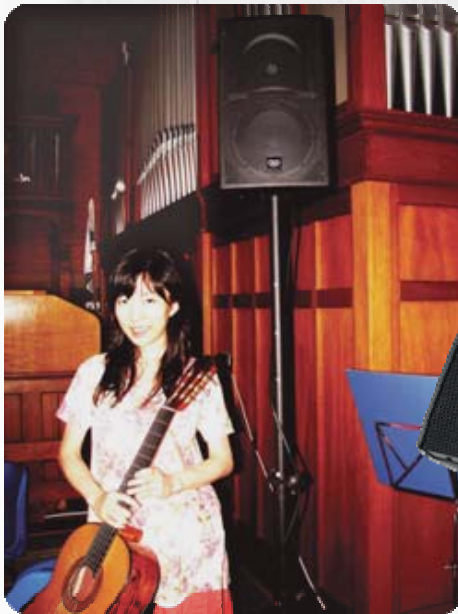
Xuefei Yang Classical guitar concert Henley-on-Thames UK