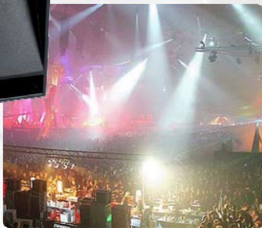
Rental systems used around the world